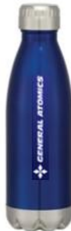
Vacuum bottle (w/ laser engraved GA logo) $15.00 GA or EMS logo