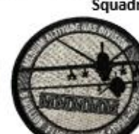
5 Million Flight Hours