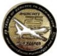
25 Years of Service (Front and Back) - $15.00