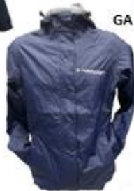
New Style Wind Jacket Sizes S-3XL: $55.00 Nylon/Polyester/Lined ASI/EMS Logo only