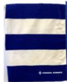
Beach Towel $28.00 GA or EMS logo