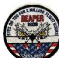
2 Million Flight Hours