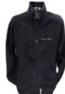
GA & ASI Fleece Jacket Extra small-XL: $35.00 2XL-3XL $40.00 100% Polyester