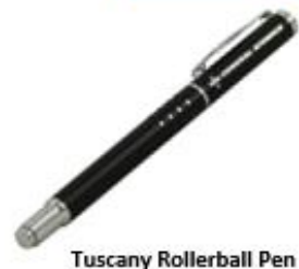
Tuscany Rollerball Pen Black ink, comes in velveteen pouch $9.00 GA or EMS logo