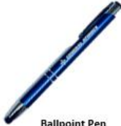
Ballpoint Pen Black ink, with stylus $5.00 GA or EMS logo