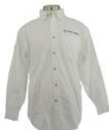
Button Down: White Dress Shirt GA or ASI Logo Sizes S-3XL: $43.00 100% Cotton