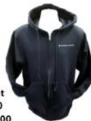
Hoodie Zipper Front S-XL $32.00 2XL-3XL $36.00 50% Cotton/ 50% Polyester