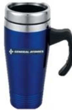
Travel Mug 16 Oz double wall 18/8 stainless steel, foam insulated w/ push on swivel lid $15.00 EMS logo only