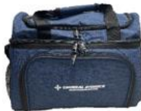
Large Cooler $28.00 12 can capacity with shoulder strap GA or EMS logo Small cooler (not shown) EMS logo only $16.50