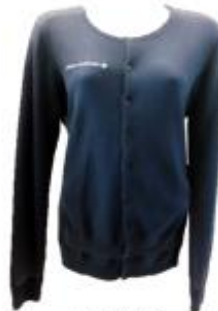
Cardigan S-XL: $40.00 60% Cotton 40% Nylon