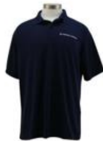
Sport-Tek Dry Zone Raglan Polo Sizes S-3XL: $35.00 100% Polyester