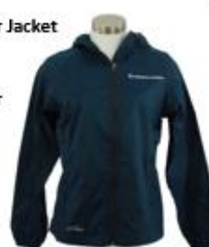
Wind Jacket Sizes S-3XL: $48.00 Nylon/Polyester GA/ASI logo only

Purchase these items through all ERA stores or send us an order form found on our website. www.ga-era.org • Office: (858) 455-3305 • Fax: (858) 455-3302 • Email: era.office@ga.com