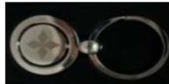
Keychain $7.00 GA logo