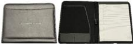
Meeting Book Debossed GA or EMS Logo, Faux leather $25.00