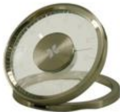
Desk Clock 5.5" $40.00 GA logo