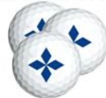
Titleist NXT Tour Ball

SPECIAL OFFER: Golf towel & sleeve of 3 golf balls: $26.00