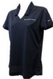
Nike Sport-Tek Dry Zone Raglan Polo S-2XL: $38.00 100% Polyester