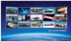
General Atomics/EMS logo