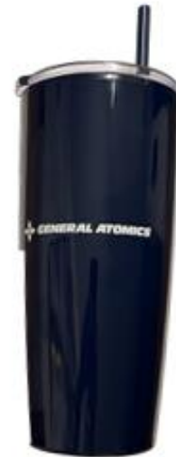
24 Oz. Hot and Cold Tumbler Double Walled $13.00 GA logo only

You may purchase these items at any of our ERA stores.