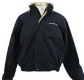
Panorama Bomber Jacket Sizes S-3XL: $70.00 35% Cotton 65% Polyester EMS logo all sizes available GA/ASI sizes very limited.