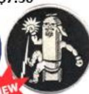
NEW WWII Bombardment Squadron