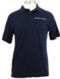
Polo Shirts Sizes S-3XL: $35.00 35% Cotton 65% Poly