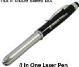
4 In One Laser Pen LED light, red laser pointer, stylus, and ball point pen. $14.50 GA or EMS logo