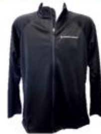
Sport Zipper Jacket Sizes S-XL: $48.00 Sizes 2XL-3XL: $50.00 100% Polyester