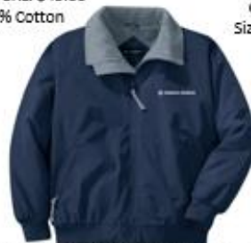
GA & ASI Challenger Bomber Jacket Sizes S-3XL: $65.00 Shell: 100% Nylon Lining: 100% Polyester