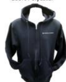
Hoodie Zipper Front S-XL $32.00 2XL-3XL $36.00 50% Cotton/ 50% Polyester