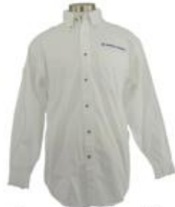
Button Down Dress Shirt White only GA/ASI only S-3XL: $43.00 100% Cotton