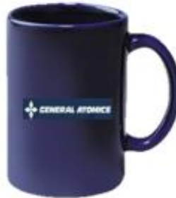
Coffee Mug $9.00 GA or EMS logo