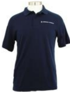
Polo Shirt S-3XL: $35.00 35% Cotton 65% Poly GA/ASI logo only