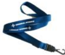
Lanyard $5.00 GA/EMS/ASI