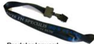
Predator lanyard $8.00