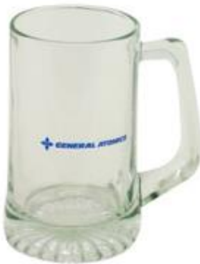
Beer Mug $10.00 GA or EMS logo