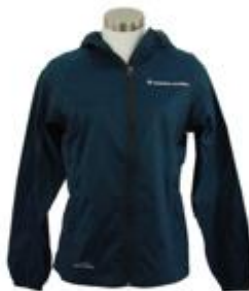
Wind Jacket S-XL: $48.00 GA/ASI logo only 2XL-3XL: $50.00 Nylon/Polyester/Unlined