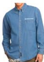
Denim Long Sleeve Shirt GA or ASI Logo Sizes S-3XL: $43.00