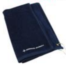
Golf Towel with erommet

SPECIAL OFFER: Golf towel & sleeve of 3 golf balls: $26.00