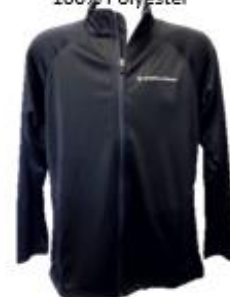
Sport Zipper Jacket S-XL: $48.00 2XL-3XL: $50.00 100% Polyester

Purchase these items through all ERA stores or send us an order form found on our website. www.ga-era.org • Office: (858) 455-3305 • Fax: (858) 455-3302 • Email: era.office@ga.com