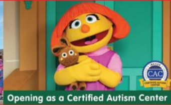
Opening as a Certified Autism Center

Sesame Place San Diego is a door that will open to a wonderful world full of thrill, fun, and entertainment. If you want to enjoy a day of your life to the fullest without shelling out a lot of money, then this park is where you want to go.