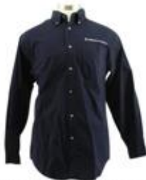
Button Down: Navy Dress Shirt Sizes S-3XL: $43.00 100% cotton EMS Logo navy button down dress shirt Cotton/Poly blend. Wrinkle resistant. $43.