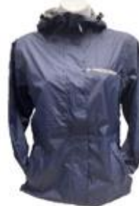
Wind Jacket S-3XL EMS logo only Nylon/Poly/Lined $55.00