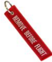
Predator/Reaper Key Chain $7.00