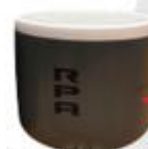
RPA Ceramic Coffee Mug (Blue or gray) $11.00