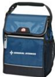
Igloo Avalanche Cooler/Lunch Bag $16.50 GA logo