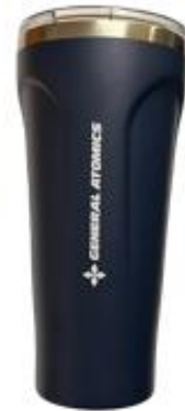
30 Oz. Travel Coffee Mug Double Walled $15.00 GA logo only