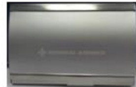
Business Card Holder $10.00 GA or EMS logo