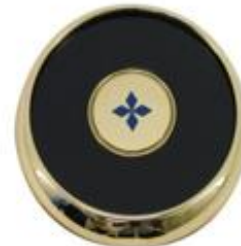
Coaster $19.00 GA logo