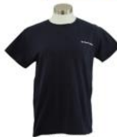
T-Shirts Short sleeve Sizes S-3XL: $17.00 Pre-shrunk 100% cotton