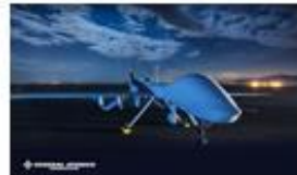
General Atomics Aeronautical