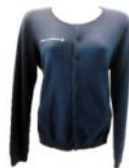
Cardigan S-XL: $40.00 60% Cotton 40% Nylon