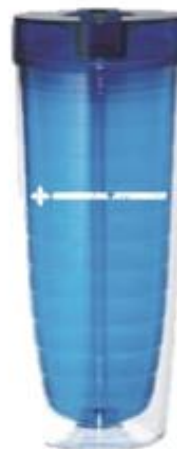
Hot & Cold Tumbler 20 Oz. (BPA free) Double walled $13.00 GA or EMS logo