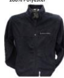
Fleece Jacket Sizes S-XL: $35.00 Sizes 2XL-3XL: $40.00 100% Polyester