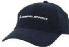
Baseball Caps Solid: $17.00 Mesh: $17.00 GA/EMS/ASI logo