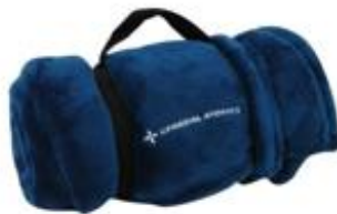
Micro plush Blanket With Carrying Straps $32.50 GA or EMS logo