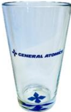
Pint Glass $10.00 GA or EMS logo