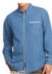
Denim Long Sleeve Shirt GA or ASI Logo Sizes S-3XL: $43.00