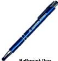
Ballpoint Pen Black ink, with stylus $5.00 GA or EMS logo