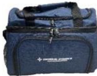
Large Cooler $28.00 12 can capacity with shoulder strap GA or EMS logo Small cooler (not shown) EMS logo only $16.50