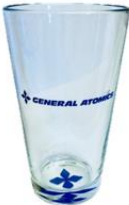
Pint Glass $10.00 GA or EMS logo