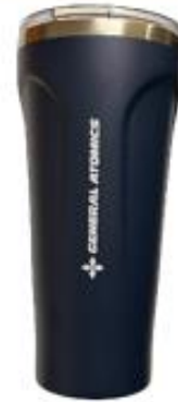
30 Oz. Travel Coffee Mug Double Walled $15.00 GA logo only