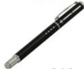
Tuscany Rollerball Pen Black ink, comes in velveteen pouch $9.00 GA or EMS logo