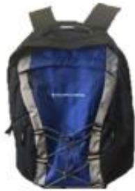
Laptop Backpack $27.00 GA or EMS logo