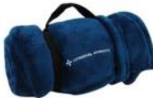
Micro plush Blanket With Carrying Straps $32.50 GA or EMS logo