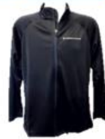
Sport Zipper Jacket Sizes S-XL: $48.00 Sizes 2XL-3XL: $50.00 100% Polyester