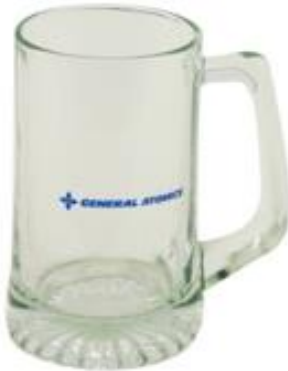
Beer Mug $10.00 GA or EMS logo