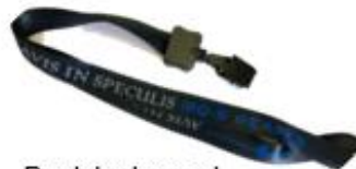
Predator lanyard $8.00