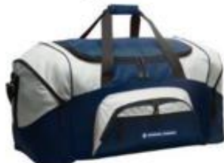
Sport Duffel Bag $32.50 GA or EMS logo