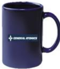
Coffee Mug $9.00 GA or EMS logo