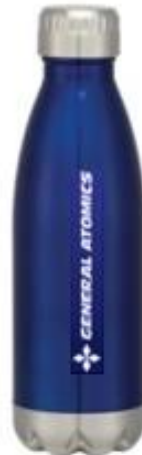
Vacuum bottle (w/ laser engraved GA logo) $15.00 GA or EMS logo