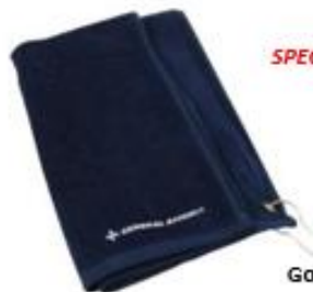
Golf Towel with grommet $14.00 GA or EMS logo

SPECIAL OFFER: Golf towel & sleeve of 3 golf balls: $26.00