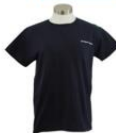
T-Shirts Short sleeve Sizes S-3XL: $17.00 Pre-shrunk 100% cotton