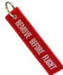
Predator/Reaper Key Chain $7.00