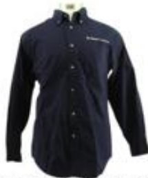
Button Down: Navy Dress Shirt Sizes S-3XL: $43.00 100% cotton EMS Logo navy button down dress shirt Cotton/Poly blend. Wrinkle resistant. $43.