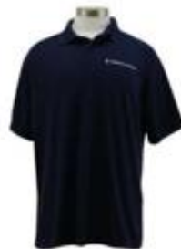
Sport-Tek Dry Zone Raglan Polo Sizes S-3XL: $35.00 100% Polyester