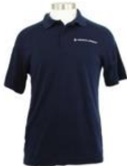
Polo Shirt S-3XL: $35.00 35% Cotton 65% Poly GA/ASI logo only