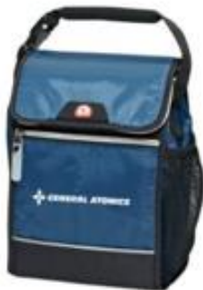
Igloo Avalanche Cooler/Lunch Bag $16.50 GA logo