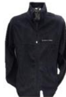
GA & ASI Fleece Jacket Extra small-XL: $35.00 2XL-3XL $40.00 100% Polyester