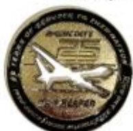
25 Years of Service (Front and Back) - $15.00