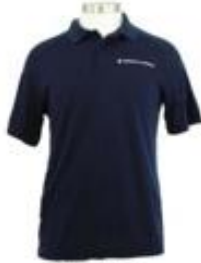
Polo Shirts Sizes S-3XL: $35.00 35% Cotton 65% Poly