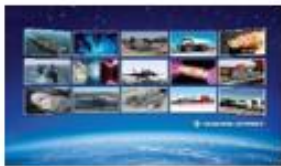
General Atomics/EMS logo