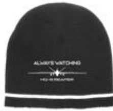
Always Watching beanie $15.00