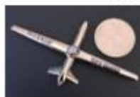
Det 3 Plane coin $15.00