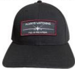
Always Watching Pukka Brand Predator Cap (Red Bill/Snap Back/High Profile Crown) Solid or mesh $25.00