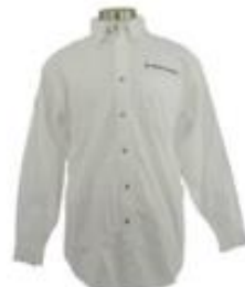
Button Down: White Dress Shirt GA or ASI Logo Sizes S-3XL: $43.00 100% Cotton