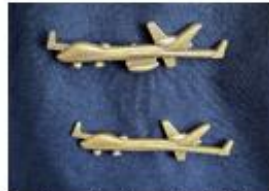
Sea Guardian Lapel/Tie Pin (top) Sky Guardian Lapel/Tie Pin (bottom) $7.00