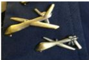
Predator lapel/tie pins Pred. B & Gray Eagle $7.00