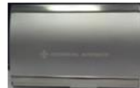
Business Card Holder $10.00 GA or EMS logo