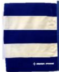
Beach Towel $28.00 GA or EMS logo