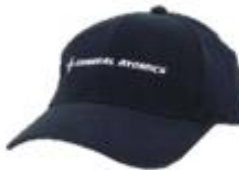
Baseball Caps Solid: $17.00 Mesh: $17.00 GA/EMS/ASI logo