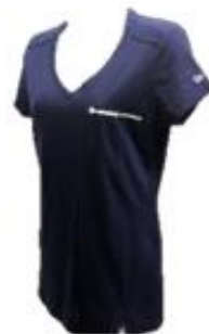
Era T-Shirts Short sleeve S-3XL: $17.00 60% Cotton, 40% Polyester