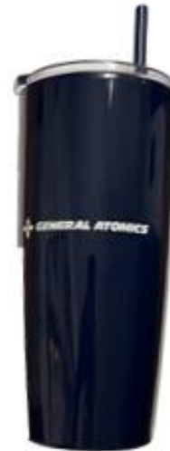
24 Oz. Hot and Cold Tumbler Double Walled $13.00 GA logo only

You may purchase these items at any of our ERA stores.