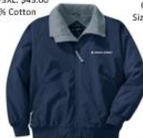
GA & ASI Challenger Bomber Jacket Sizes S-3XL: $65.00 Shell: 100% Nylon Lining: 100% Polyester