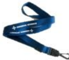
Lanyard $5.00 GA/EMS/ASI