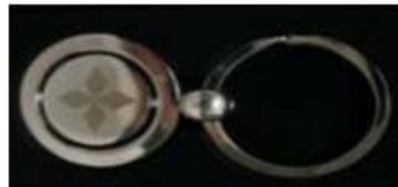
Boxed Keychain $7.00 GA logo only

Purchase these items through all ERA stores, You may email us an order form found on our website: www.ga-era.org • Office: (858) 455-3305 • Email: era.office@ga.com