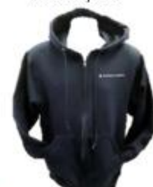
Hoodie Zipper Front S-XL $32.00 2XL-3XL $36.00 50% Cotton/ 50% Polyester