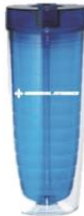
Hot & Cold Tumbler 20 Oz (BPA free) Double walled $13.00 GA or EMS logo