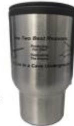
Travel Coffee mug $15.00