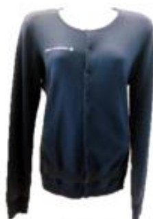
Cardigan S-XL: $40.00 60% Cotton 40% Nylon