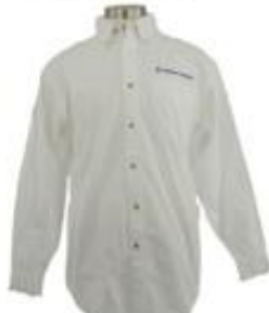
Button Down Dress Shirt White only GA/ASI only S-3XL: $43.00 100% Cotton