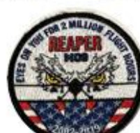
2 Million Flight Hours