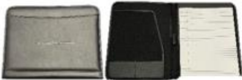
Meeting Book Debossed GA or EMS Logo, Faux leather $25.00