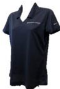
Nike Sport-Tek Dry Zone Raglan Polo S-2XL: $38.00 100% Polyester