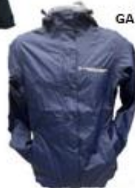
New Style Wind Jacket Sizes S-3XL: $55.00 Nylon/Polyester/Lined ASI/EMS Logo only