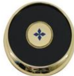
Coaster $19.00 GA logo