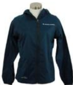
Wind Jacket S-XL: $48.00 GA/ASI logo only 2XL-3XL: $50.00 Nylon/Polyester/Unlined