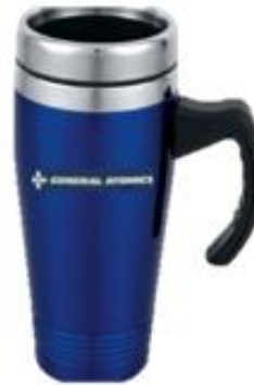
Travel Mug 16 Oz double wall 18/8 stainless steel, foam insulated w/ push on swivel lid $15.00 EMS logo only