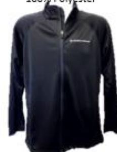
Sport Zipper Jacket S-XL: $48.00 2XL-3XL: $50.00 100% Polyester

Purchase these items through all ERA stores, or send us an order form found on our website. www.ga-era.org • Office: (858) 455-3305 • Email: era.office@ga.com