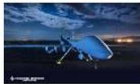
General Atomics Aeronautical