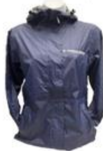
Wind Jacket S-3XL EMS logo only Nylon/Poly/Lined $55.00