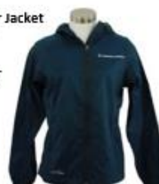
Wind Jacket Sizes S-3XL: $48.00 Nylon/Polyester GA/ASI logo only

Purchase these items through all ERA stores, You may send us an order form found on our website. www.ga-era.org • Office: (858) 455-3305 • Email: era.office@ga.com