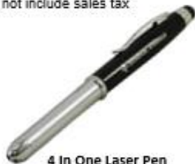
4 In One Laser Pen LED light, red laser pointer, stylus, and ball point pen. $14.50 GA or EMS logo