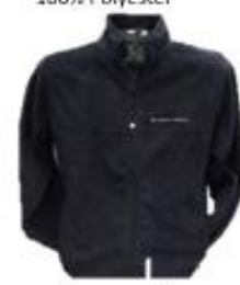
Fleece Jacket Sizes S-XL: $35.00 Sizes 2XL-3XL: $40.00 100% Polyester