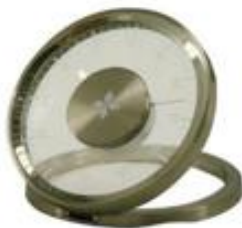
Desk Clock $40.00 GA logo only