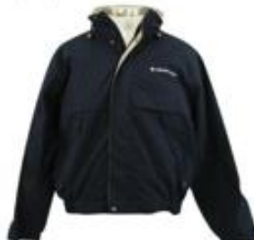
Panorama Bomber Jacket Sizes S-3XL: $70.00 35% Cotton 65% Polyester EMS logo all sizes available GA/ASI sizes very limited.