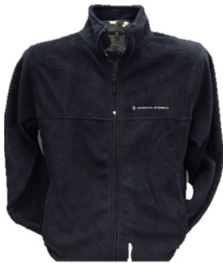
GA/EMS/ASI logo Fleece Jacket S-XL $35.00 2X-3X $40.00 Also available in women's sizes S-3XL