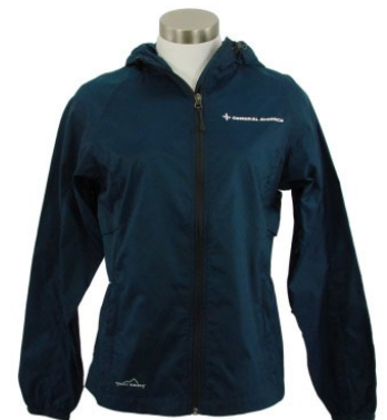
GA/EMS/ASI Wind Jacket Lined S-3XL $55.00 Unlined GA or ASI only S-XL $48.00 2XL-3XL $50.00 Hood included.