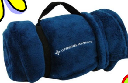
GA Micro Plush Blanket with carrying straps $32.50