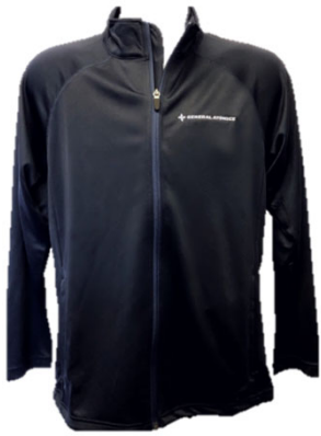
GA/EMS/ASI Sport Tek Zippered Jacket S-XL $48.00 2X-3X $50.00 Also available in women's sizes S-XL $48.00 2XL- 3XL $50.00