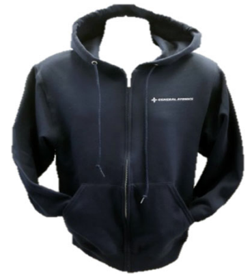
Hoodie GA/EMS/ASI Zipper Front S-XL $32.00 2XL-3XL $36.00 50% Cotton/ 50% Polyester