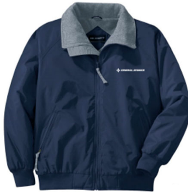
Challenger Bomber Jacket Sizes S-3XL: $65.00 GA/ASI logo only Shell: 100% Nylon Lining: 100% Polyester