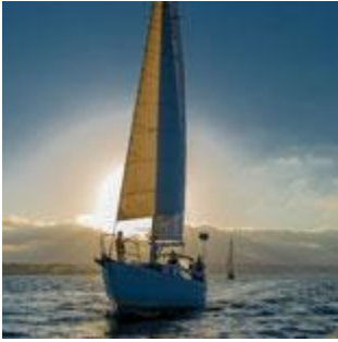
Cruise the Harbor