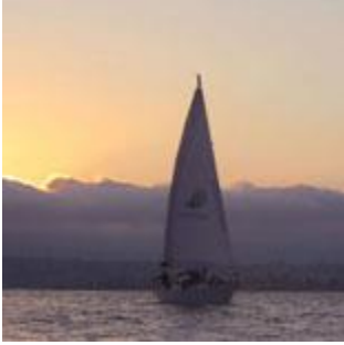
Sail Aboard A Restored Luxury Sailing Vessel

Adults $82.59 no processing fees. To order these tickets please send a ticket order form to the ERA. Your tickets will be sent to your email.